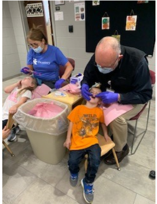
UK Dental provides services to Head Start students